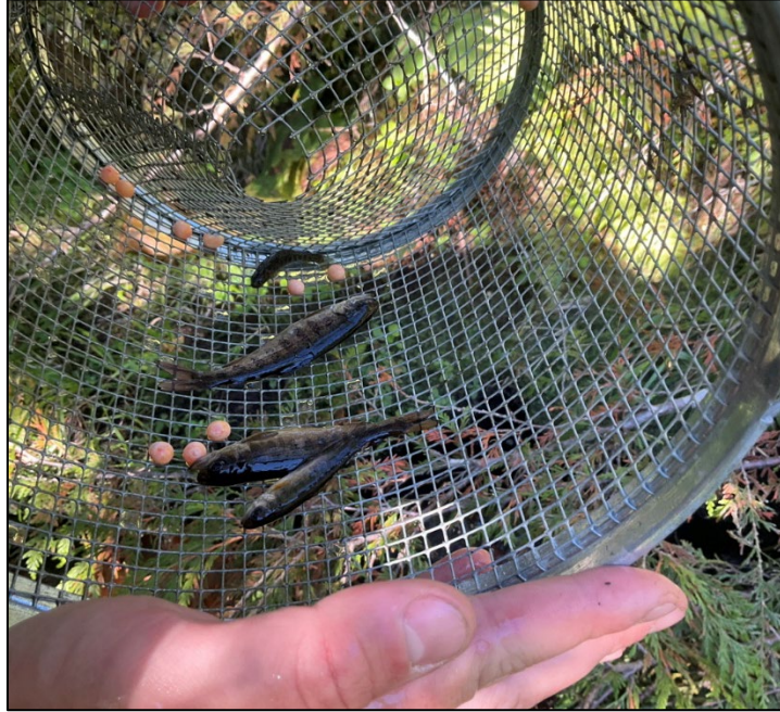
Figure 1.—Juvenile coho salmon and Dolly Varden caught at waypoint 1007.