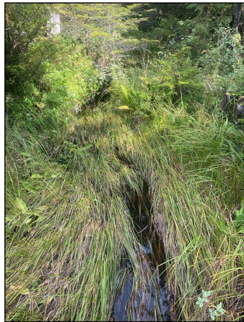
Figure 3.—Channel upstream of road crossing at waypoint 1026.