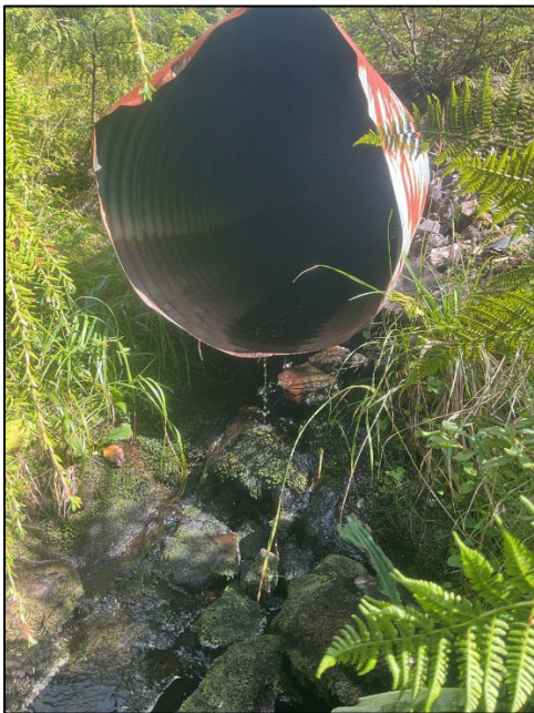
Figure 2.—Perched culvert at waypoint 1007.